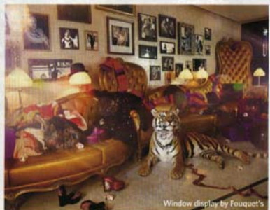
Window display by Fouquet's

Refer to our Shopping listings for address and opening hours.